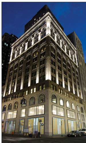
292 Madison Avenue – New York, NY